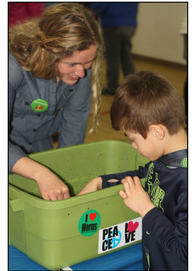
MSU Worm Team returns in 2017!

I hope you come to Science Club this year and plan to go to the STEM Festival to learn lots of cool stuff!